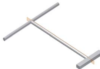
Figure 2 Quick Inspect Wrench