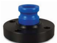
2pc. KPY Series Male Adapter Flange