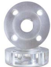
Sight Glass Flange

We can manufacture any of the listed products in most materials requested, including: