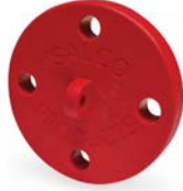
Steel Reinforced UHMWPE Blind Flange