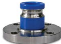
2pc. KPY 304SS Reinforced Male Adapter Flange