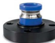
2pc. KPY UHMWPE Reinforced Male Adapter Flange