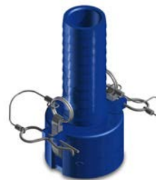
Barb x UHMWPE Female Coupler