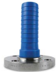
2pc. BSS Series Barb x 304SS 150# Flange