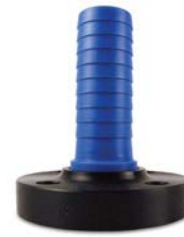
2pc. BPY Series Barb x UHMWPE 150# Flange