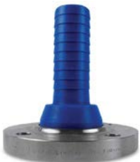
2pc. Reducing Barb x 304SS 150# Flange